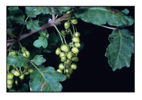
Figure 5. Poison oak fruit.