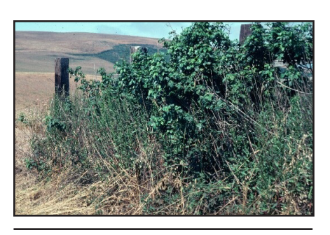
Figure 1. Poison oak as a shrub.

Contact with poison oak leaves or stems at any time of the year can cause an allergic response. When the allergen contacts the skin surface of sensitive individuals, the surrounding cells rapidly absorb it. Within 1 to 6 days, skin irritation and itching will be followed by water blisters, which can exude serum. Contrary to popular belief, the exuded serum does not contain the allergen and does not transmit the rash to other regions of the body or to other individuals. The dermatitis rarely lasts more than 10 days. Only about 15 to 20% of the population is immune to the allergenic reaction caused by poi-