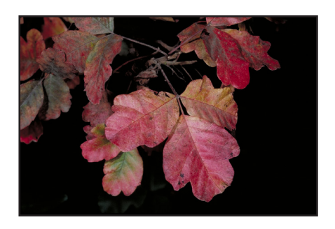
Figure 6. Poison oak fall foliage.