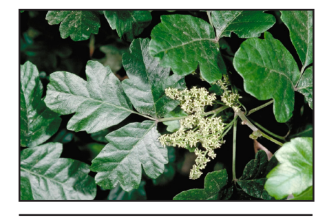
Figure 3. Poison oak leaves and flower.

You can physically remove plants located in a yard or near houses through hand pulling or mechanical grubbing