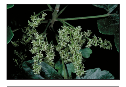
Figure 4. Poison oak flowers.